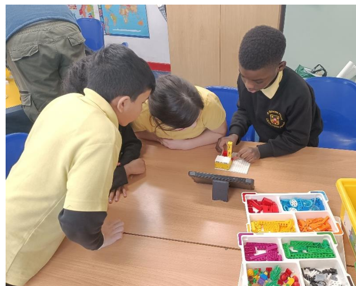
Children in Year 3 using the Lego to build a Ferris wheel

During the last week, we had a visit from East Norfolk Sixth Form College and took part in a Lego education session. We worked in teams of 4 or 5 to build a Ferris wheel using an iPad for instructions and then programmed it to make it turn and light up. We had a great afternoon working together as a team, taking it in turns and helping each other.