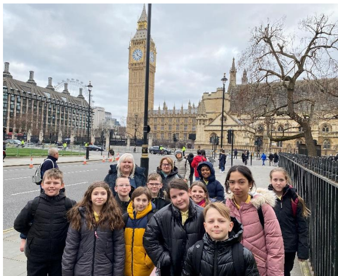
Priory Parliament by The Elizabeth Tower.

We'd like to say a BIG thank you to all our families for the support you are giving your child in completing their homework, learning spellings and listening to them read. It is making such a difference to the children. They're proud of the work they are completing and excited to change their books when they come in to school which is really lovely to see.