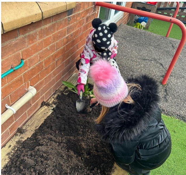
Children in Year 1 gardening