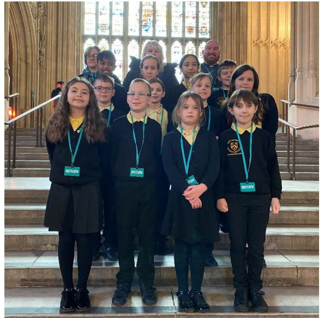
Priory Parliament in Westminster Hall

Westminster Hall is a large medieval great hall which is part of the Palace of Westminster in London, England. It was erected in 1097 for William II, at which point it was the largest hall in Europe.