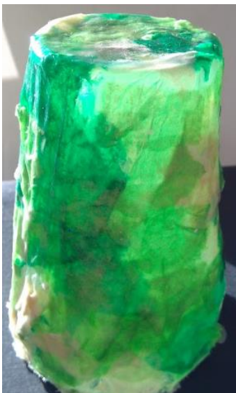
Sculpture created by covering an armature (a cup) and then removing it to leave a free-standing papier-mâché model

They have also enjoyed lessons based around food preparation, exploring how diets are influenced by the region of the world in which we live, as well as the influence of different cultures. During February, the year group has also looked at the development of Great Yarmouth through the diverse culture in which we live and the reasons for the migration of members of different communities due to a number of economic and social factors. Finally, they created some amazing piece of 3-D art, through the use of papier-mache.