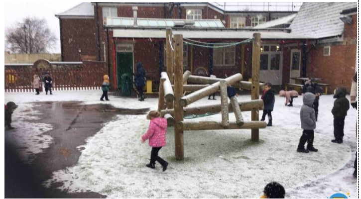
Reception children playing in the snow

The children also had a lot of fun going out and seeing the snow as well.