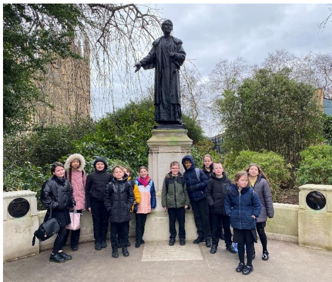
Priory Parliament by the Emmeline Pankhurst monument.

The Elizabeth Tower is the clock tower of the Palace of Westminster in London. It contains the Great Clock, a striking clock with five bells. The tower is nicknamed "Big Ben", which was originally a nickname for the largest bell (named the Great Bell). The tower was officially called the Clock Tower until 2012, when it was renamed to mark the Diamond Jubilee of Queen Elizabeth II.