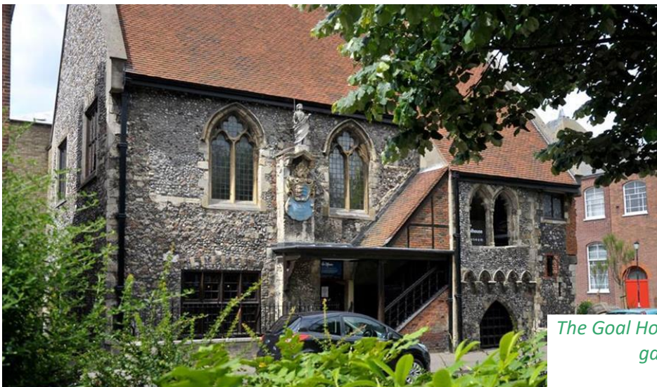
The Goal House in Great Yarmouth, one of the UK's oldest gaols, dating back to the 12th century

In maths, we have been learning to divide and share equally. We have also started looking at kilograms. We explored different types of scales and had the opportunity to weigh our own objects in the afternoons.