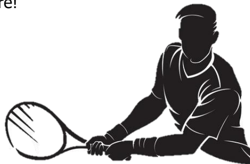
Year 6 with Alexei Popyrin, a professional tennis player

We were also lucky enough to have Alexei Popyrin, a professional tennis player, visit and answer some of our questions. The children are now producing a story based on Alexei's next adventure!