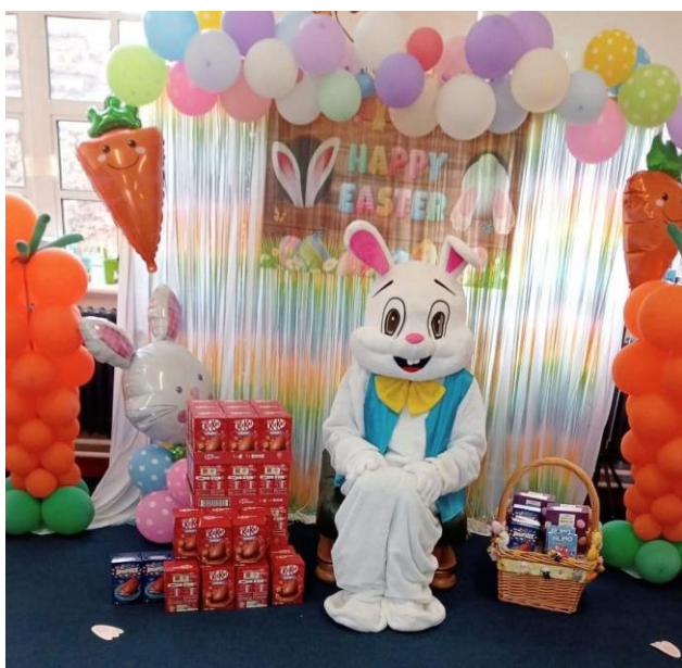
The Easter Bunny making an appearance in 2024 with a chocolate Easter Egg for every child at Priory

Priory family friends are looking to create a strong, supportive school community where every child benefits.