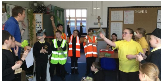
Children role playing during the Easter in a box experience.

stories, and diary entries. In reading, we have been enjoying two fantastic books: The Girl who Stole an Elephant and The Boy at the Back of the Class , both of which have sparked brilliant discussions in class.