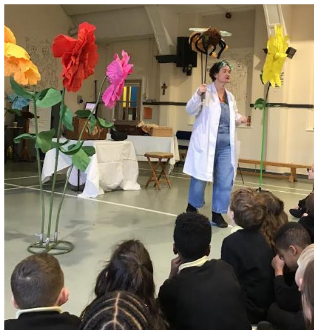
The Science Show

In our learning, we have explored the history of flight, looked at rainforests in geography and had fun with collage in art. We have written stories exploring the culture of Great Yarmouth and have continued our journeys to become super readers and mathematicians!