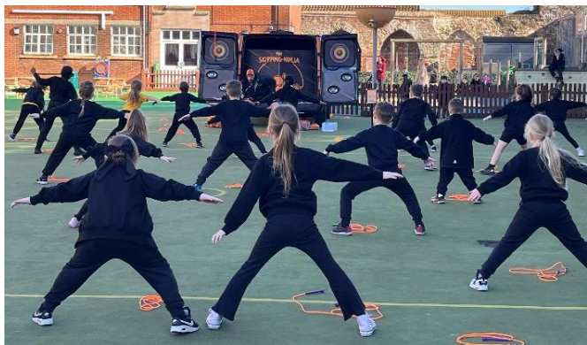
Year 2 children with the 'Skipping Ninja'

Alongside our day-to-day learning, we have had a visit from the skipping Ninja, enjoyed parading around the market in our wonderful costumes on World Book Day, were excited by the bangs and experiments at the science show and even enjoyed a visit from RaiseKids who gave us an immersive Easter experience!