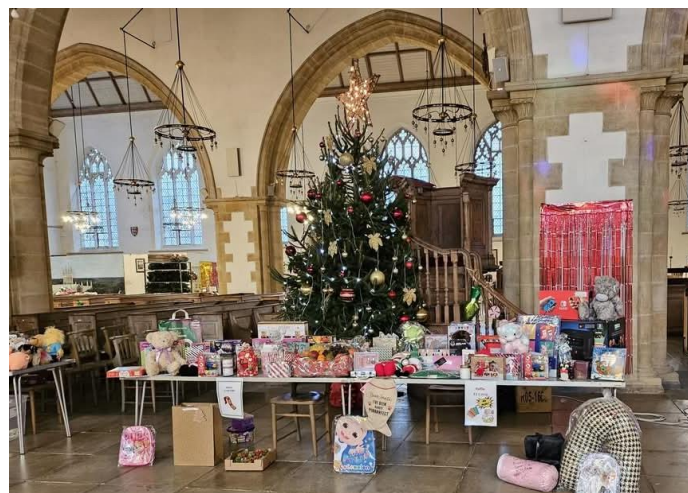
Christmas fayre at the Minster Dec 2024

Priory Family Friends are a dedicated group of parents who work tirelessly to enhance school life for our children. Over the past few months, we have been working hard to have made a real difference in so many ways. We are hoping you have noticed some of these.