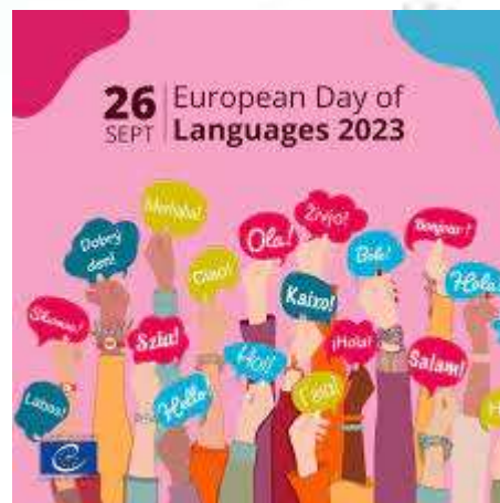
Laura, Scarlett, Alice-Mae, Nicholas and Domelio finding out which language is spoken in different European countries

In addition to their normal lessons, they have participated in The European Day of Languages, learning about the variety of languages spoken throughout Europe. They have also been looking at the properties of materials, by conducting science experiments!