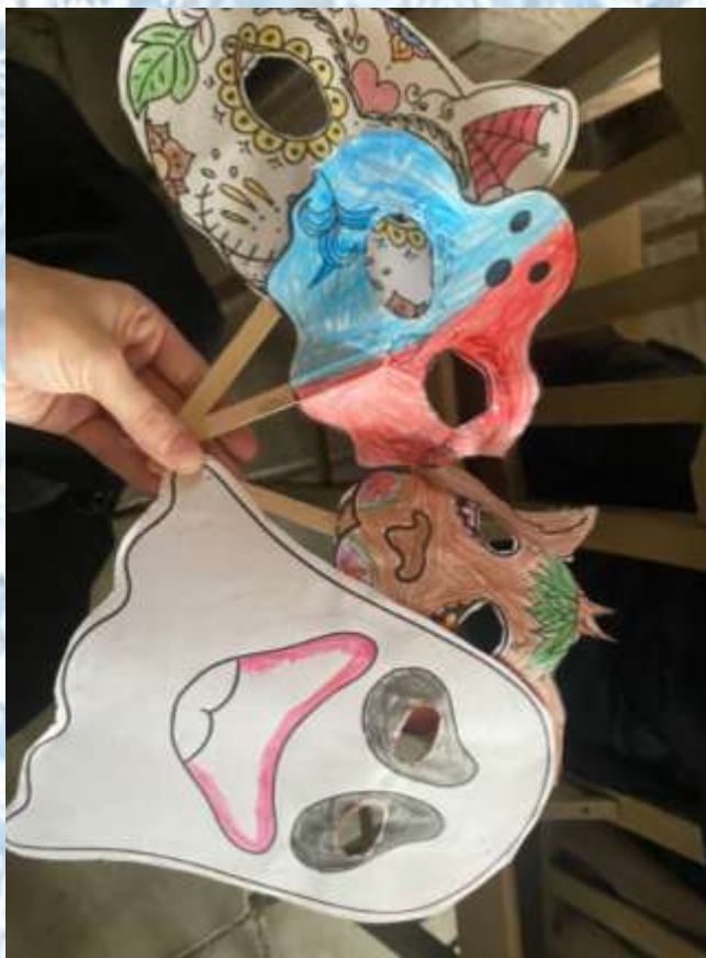
Some of the Halloween masks made by year 3