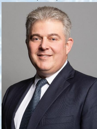
Rt Hon Brandon Lewis.

At St Nicholas Priory we encourage our pupils to have a voice so that their opinions and ideas help shape the school and beyond. Our