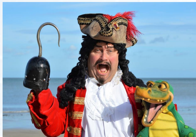
Captain Hook and Bruno

Its Panto time again .... "Oh no it isn't!" ... "Oh yes, it is!"