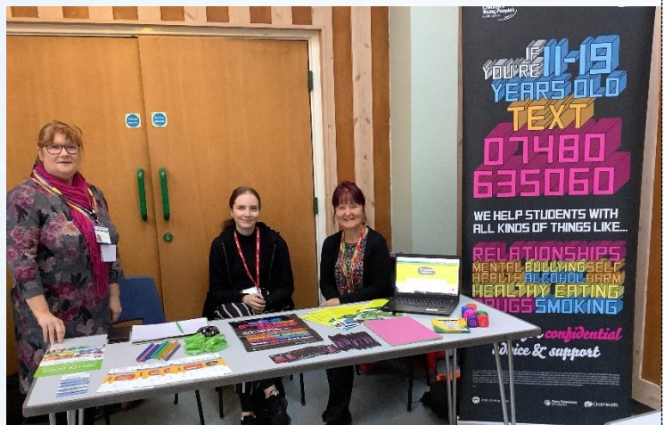
How can we help !

We recently welcomed families to our first SEND coffee morning in school. We had several different services and organisations attend to give advice and support for parents. We are very grateful to all parents who attended this event and we will be running another event in the Spring term, focusing on behaviour.