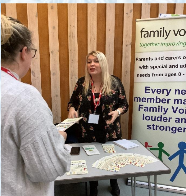
Information and professional advice from outside agencies

The children took part in an 'environmental science' degree which involved them completing tasks on this topic and then enjoying a tour and graduation ceremony at the UEA. As part of this, they were also able to visit the Sea Life Centre which allowed them to see lots of different sea life including Noah the turtle!