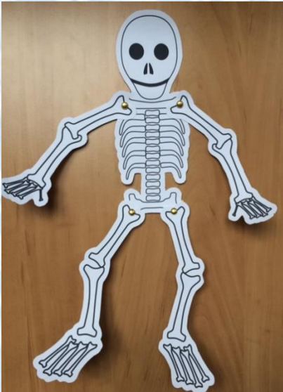
The children used split-pins to make movable skeletons

We have started the half term in Year 3 by exploring printmaking in Art. We have used rollers to make different techniques and prints.